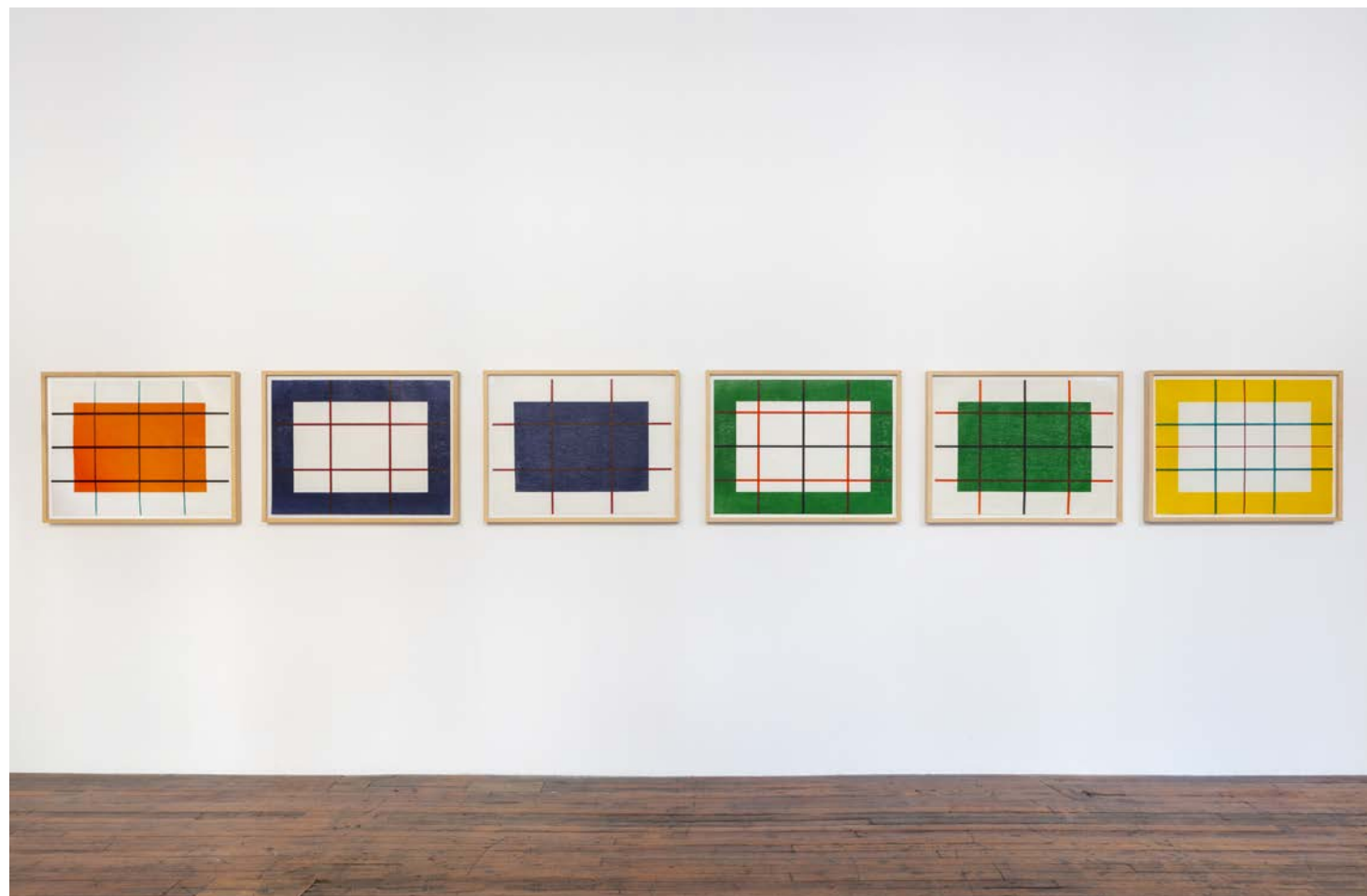
Donald Judd & Printmaking