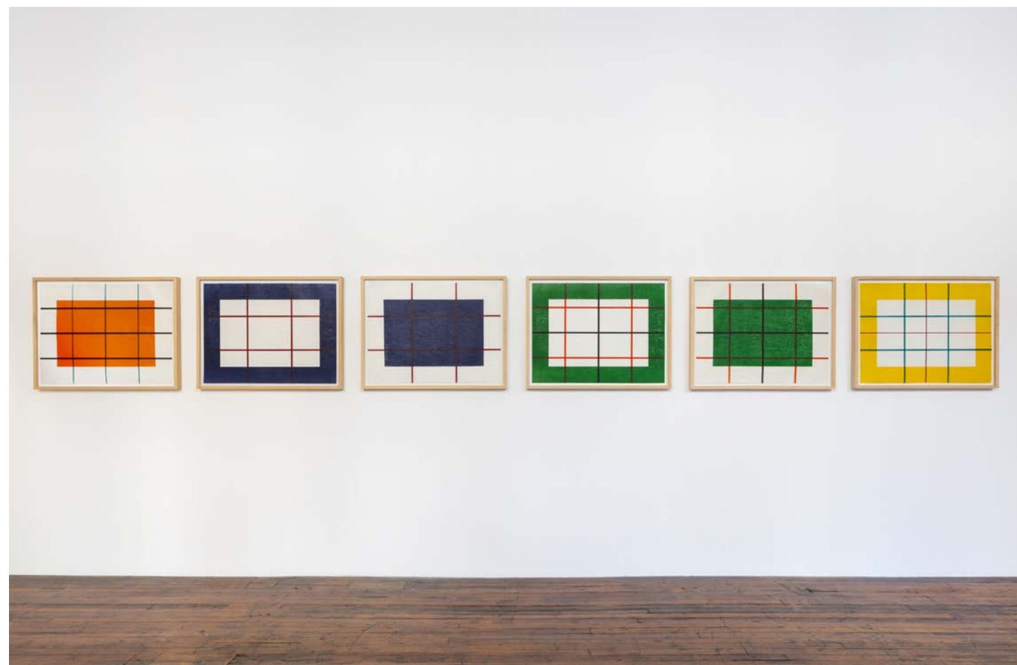
Donald Judd & Printmaking